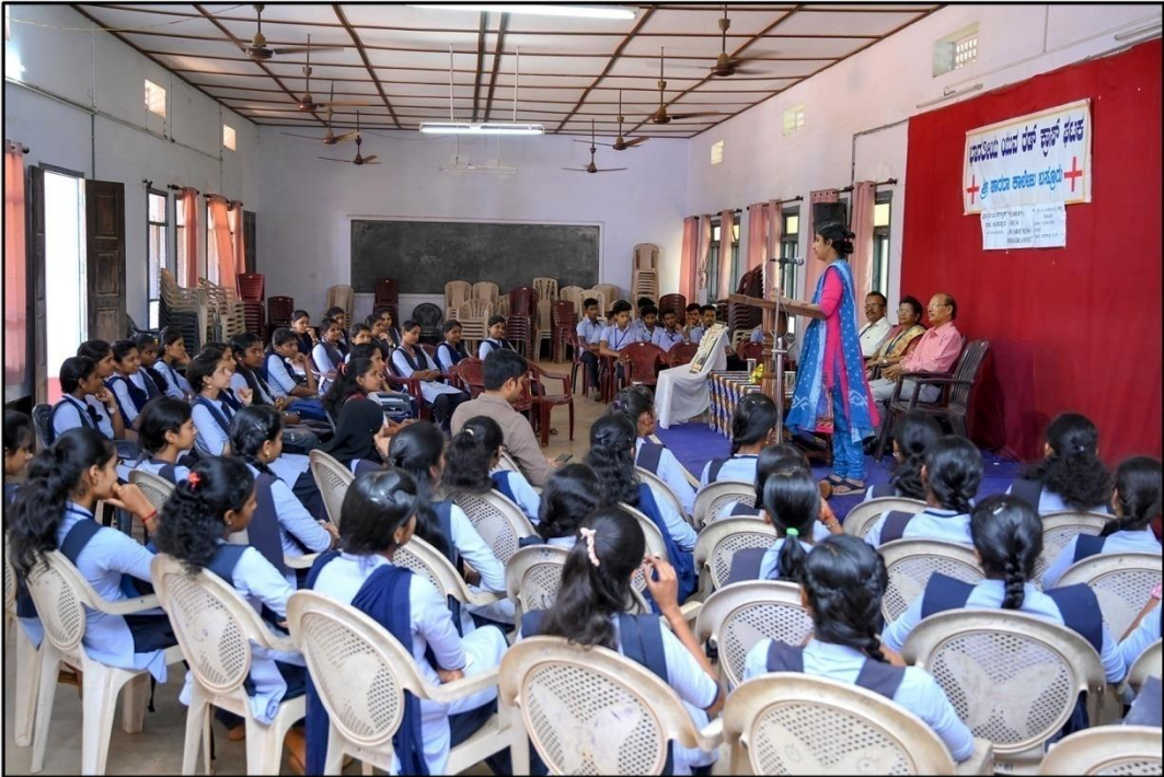
Health Awareness Program -Red Cross