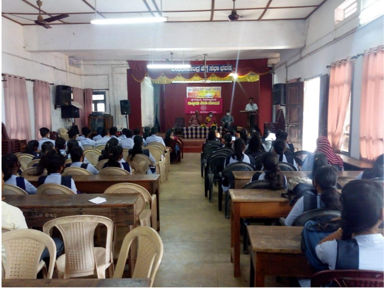
National Yuva Saptaha Celebration: Organized by Vivekananda Adhyayana Kendra , HRD Centre & NSS unit.