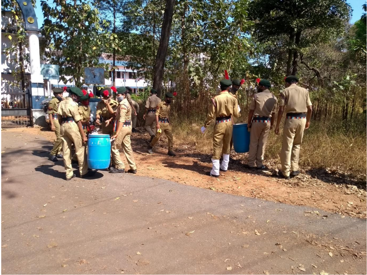
Swachchata Abhiyan By NCC