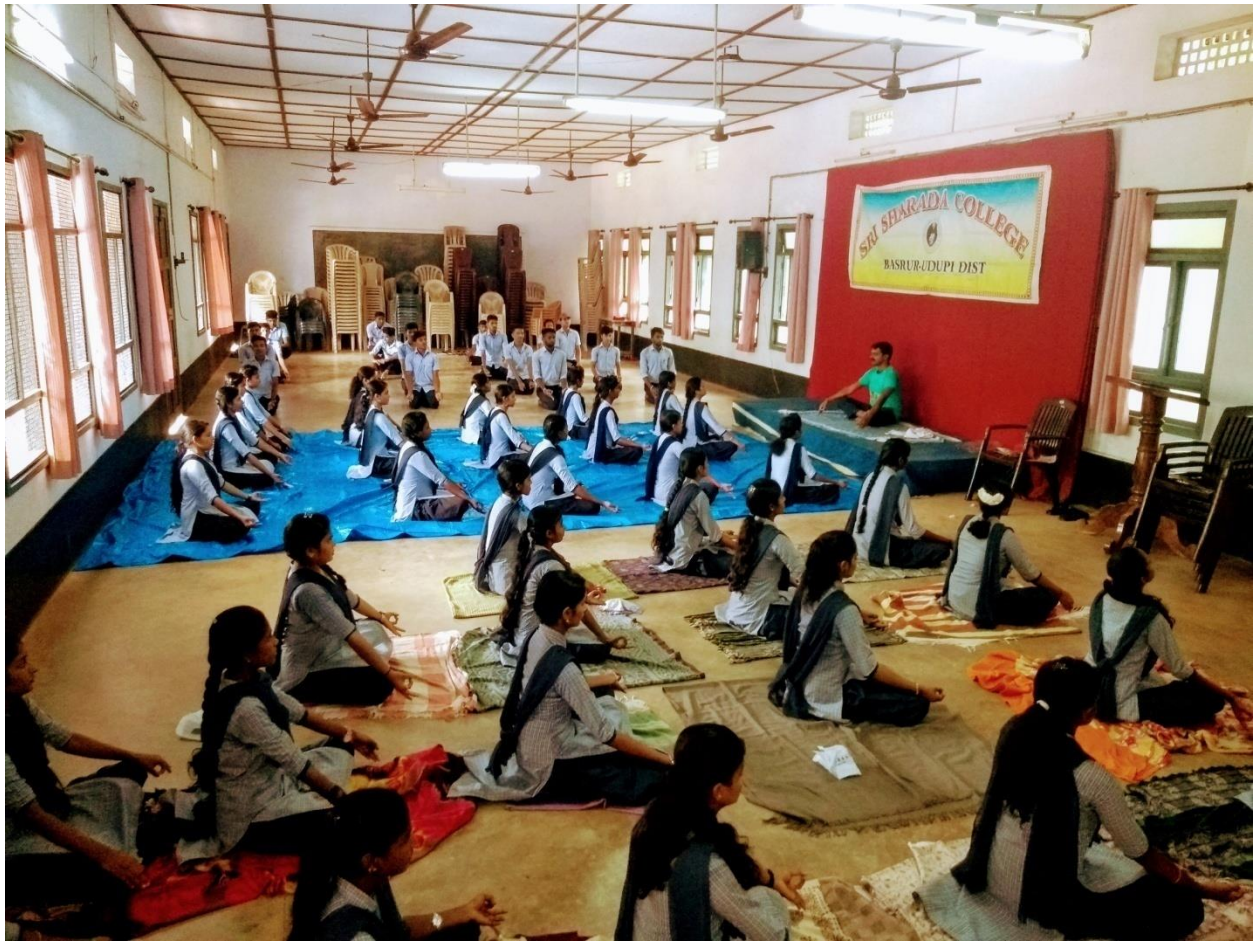
Yoga day Celebration on 21 , June 2020