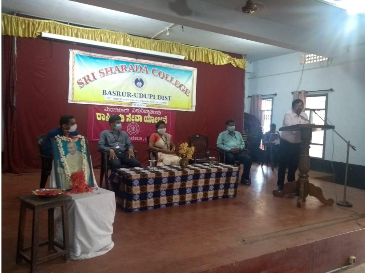
Celebration of Mahatma Gandhi Jayanthi October 2 nd 2020 ( International Non-Violence Day )