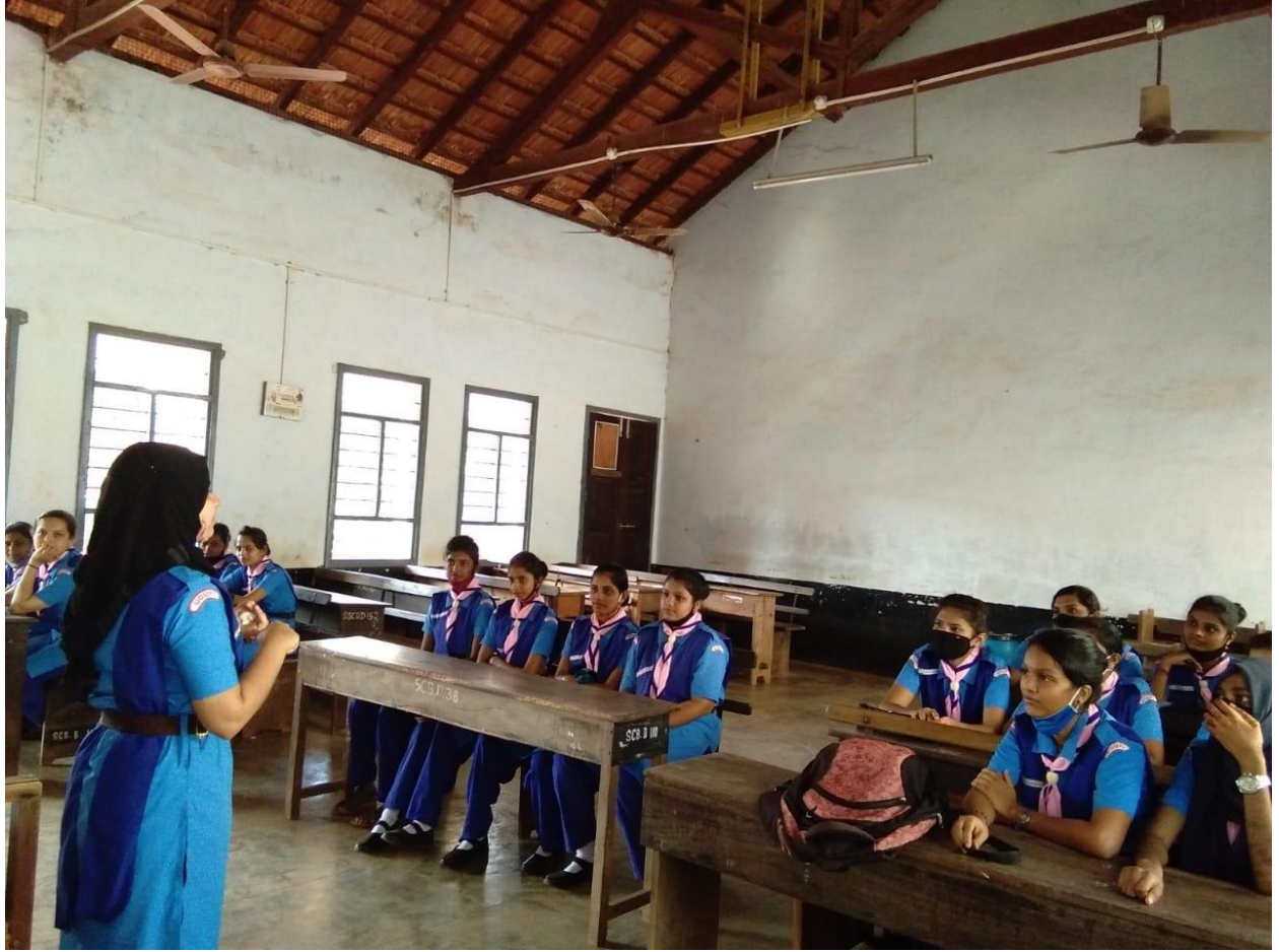
Orientation by Rovers Leader to team.