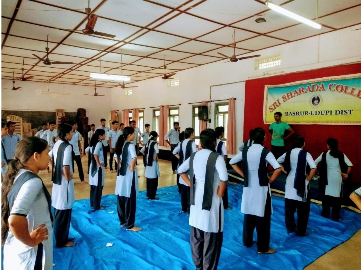
Yoga Day Celebration on June 21, 2021