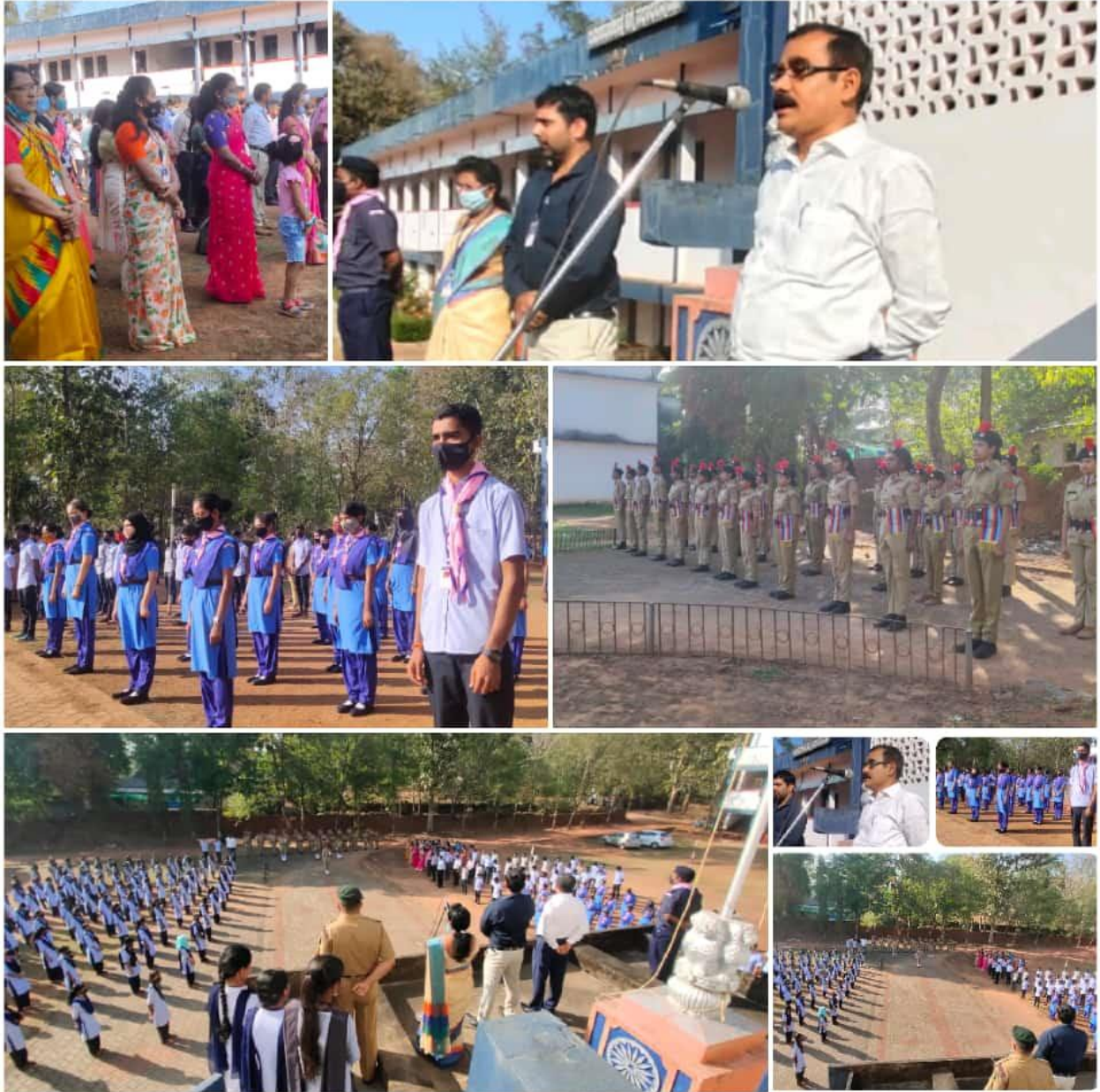
Celebration of 72 nd Republic Day