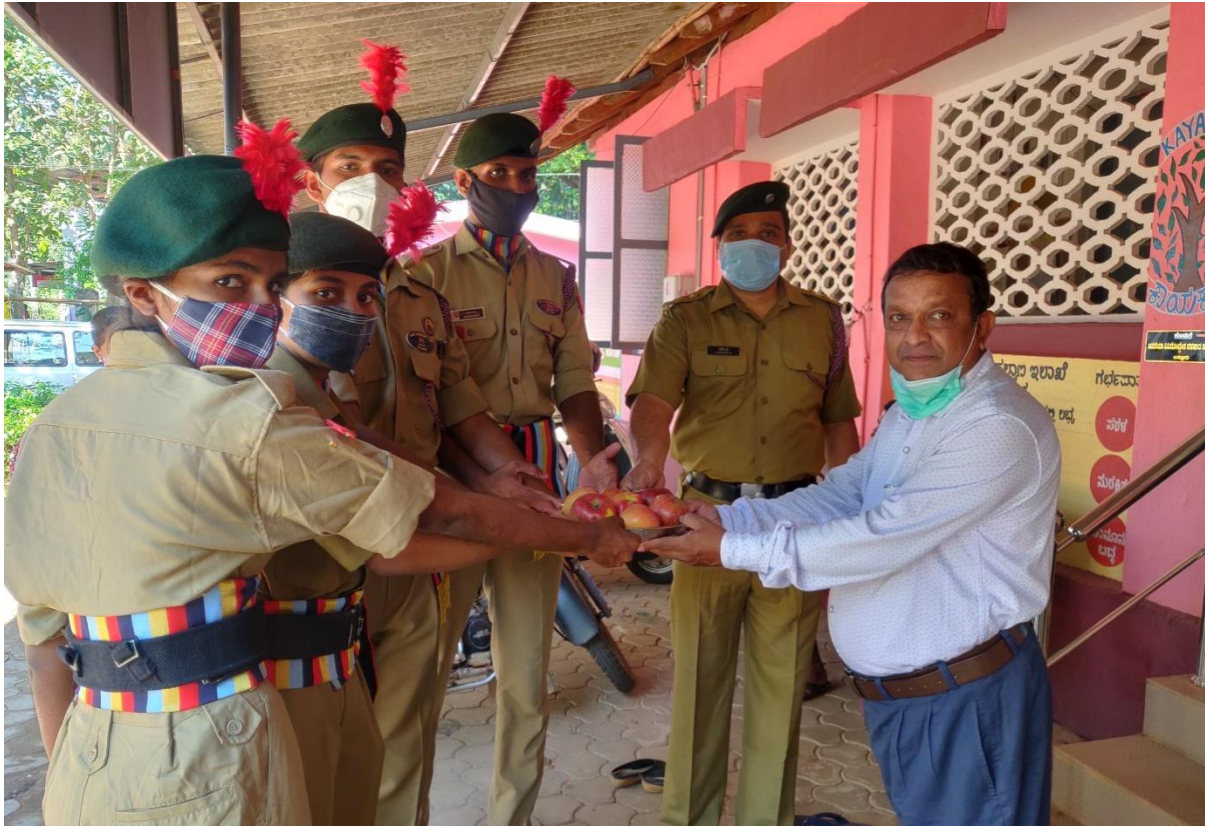
NCC Outreaching Program: Distribution of Fruits to corona worriers.